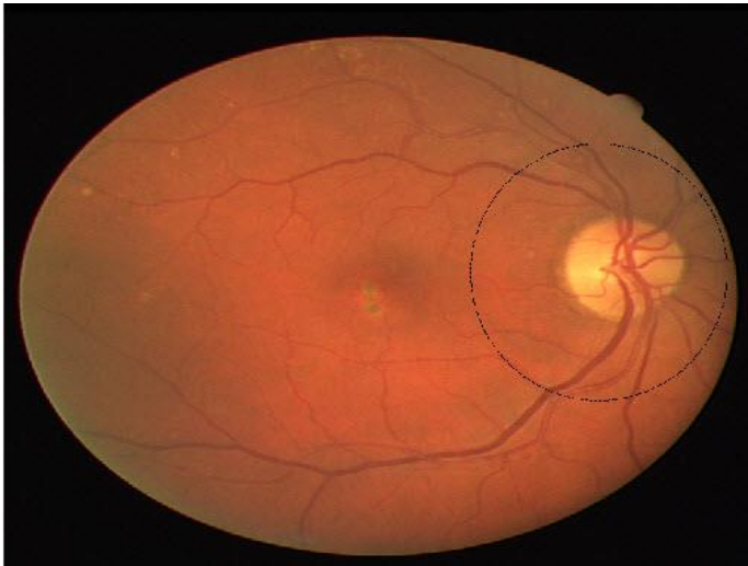
Fig. 2. The area of retinopathy in input image

The size of retinopathy part in images is 7.18 mm. There is 8 part of diabetic retinopathy which input image is in 8 parts. There classes are listed in Table (1).